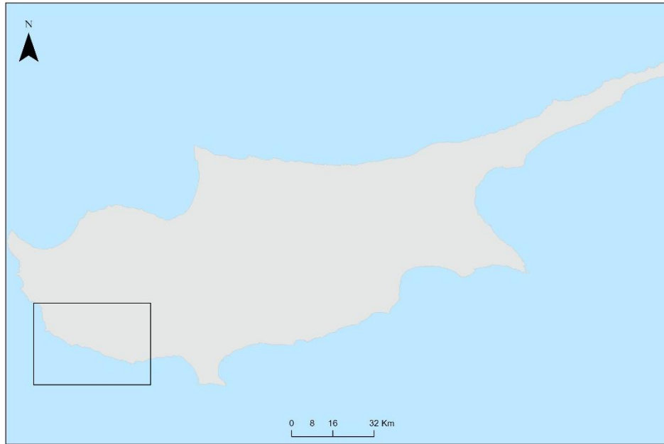
Figure 2: The study site of Cyprus

The island country of Cyprus can be found in the southern Anatolian Peninsula. It is the third largest island of the eastern Mediterranean, in a critical geostrategic location of the Levantine basin and the EMMENA region. Cyprus is bordered on north of Egypt, east of Greece, south of Turkey, and west of Lebanon and Syria. In general, the climate of Cyprus is influenced by the adjacent countries, and the climate is characterized as mild Mediterranean, with dry summers and plenty of sunshine, and short periods of wet winters with little rainfall. Summer is hot and dry. In winter, the climate is mild (not too cold) and rainy. The island suffers from severe water scarcity, along with other countries such as Bahrain, Kuwait, Lebanon, Oman, and Qatar 6 .