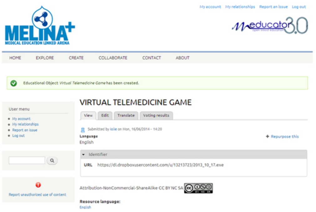
Figure 2. Interface of Melina+ (Medical Education Linked Arena), showing the Virtual Emergency TeleMedicine Game educational resource and metadata.

The VETM game is currently working as a standalone application on personal computers (PCs) with the Windows