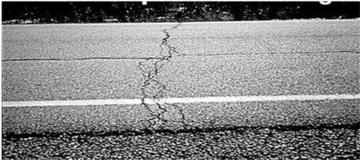
Figure 4: Transverse cracking in the asphalt pavement ( www.roadscience.net/node?page=2 ).

Transverse cracking is mainly perpendicular to the asphalt pavement centreline (Federal Highway Administration 2009). Also, transverse cracking can occur anywhere within the lane. The causes of transverse cracking are the paver blocks related to the incorrect set up, from the mixture of the asphalt, low temperatures and from cracks on the sub base of the pavement layers (Stein and Wressell 1999).