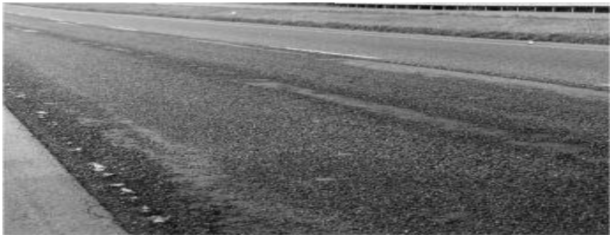
Figure 8: Raveling on the asphalt pavement ( www.roadscience.net/node?page=2 ).

Raveling is the loss of the aggregate particles and asphalt binder. Due to weathering and raveling the asphalt binder loses the bond with the aggregate (Miller, J. S., Rogers, R. B. and Rada 1993). The roadway loses its smooth surface (Stein and Wressell 1999). The poor mixture quality of asphalt, the traffic, the water and asphalt hardening due to the aging of the asphalt pavements are the reasons of the raveling (Asphalt Institute 2016). Due to the high temperatures especially in the summer, the UV rays destroy this binder between them and cause the raveling on the surface.