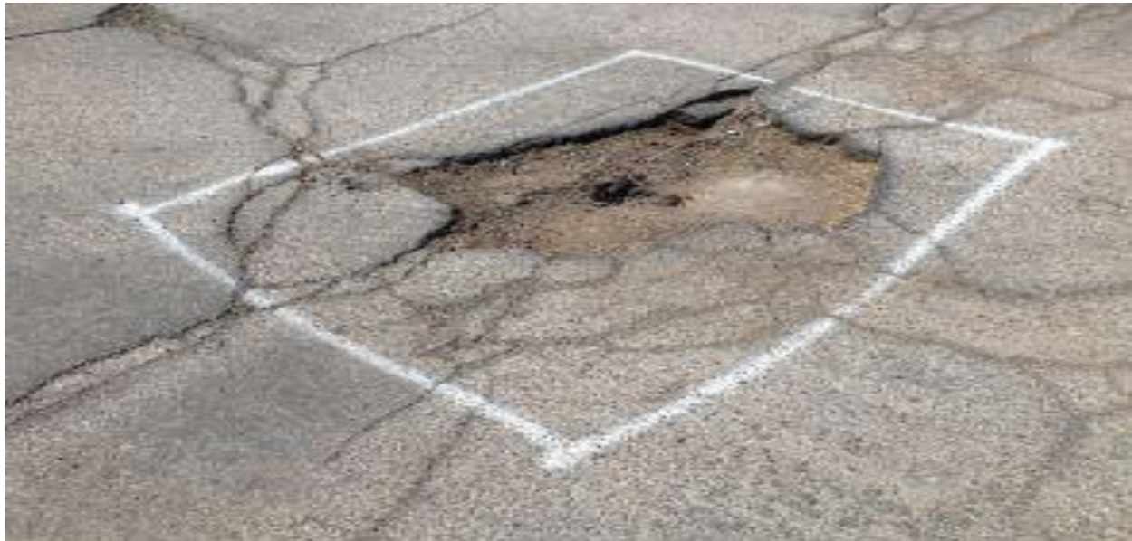
Figure 5: A pothole on the asphalt pavement.

A pothole is a bowl-shaped hole which sometimes is created in more than one layer of the asphalt pavement. In other words, the hole in the asphalt surface penetrates all the asphalt layers to the base course. Potholes usually occur on the surfaces of hot asphalt mixture road and they are about 25mm to 50mm. Also the minimum diameter of pothole is 150mm (Miller and Bellinger 2003). The main reason that causes the pothole is when the water gets into the cracks and destroys the area below the cracks causing a pothole (Miller, J. S., Rogers, R. B. and Rada 1993). In addition some other causes of potholes are the weak subgrade, poor mixture of surface and the traffic. These can accelerate the potholes (Asphalt Institute 2016).