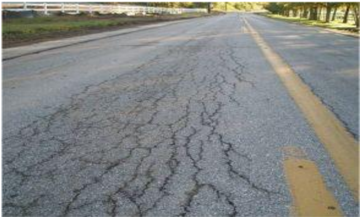
Figure 1: Alligator cracking on asphalt pavement ( www.roadscience.net/node?page=2 ).

There are different types of cracks created on the asphalt pavements. Alligator cracking is type of crack that can be observed wherever in a road lane. It's a sequence of interconnected cracks of different stages of the development. Additionally, the alligator cracks expand into many sides, sharp-angled pieces and are more often observed to the longest side of the road lane (Miller, J. S., Rogers, R. B. and Rada 1993). This type of cracking occurs mainly to the roads with repeated traffic loads and is considered to be a parallel longitudinal crack due to the wheel path that expands with time and loads (Miller and Bellinger 2003).