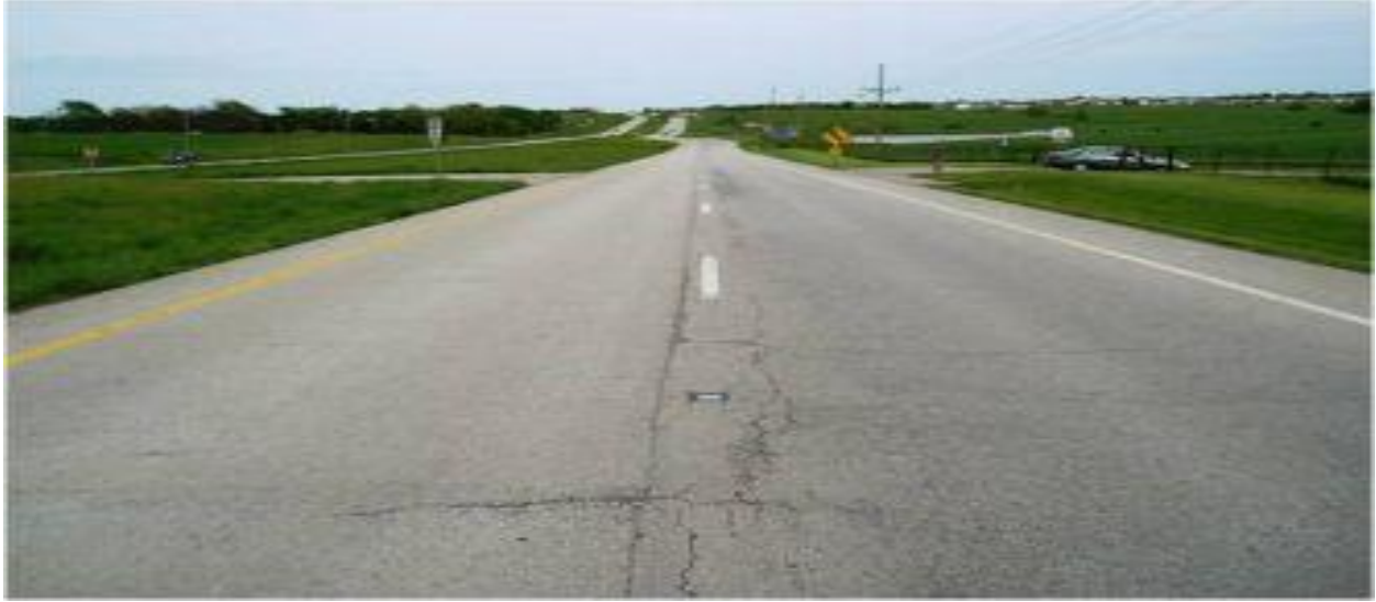
Figure 3: Longitudinal cracks in the asphalt pavement.

Transverse cracking is mainly perpendicular to the asphalt pavement centreline (Federal Highway Administration 2009). Also, transverse cracking can occur anywhere within the lane. The causes of transverse cracking are the paver blocks related to the incorrect set up, from the mixture of the asphalt, low temperatures and from cracks on the sub base of the pavement layers (Stein and Wressell 1999).