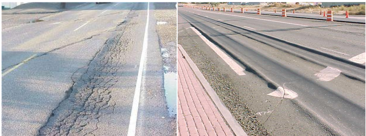
Figure 7: The two types of rutting, on left the wheel path rutting and on the right severe mix rutting ( www.roadscience.net/node?page=2 ).

Rutting is a depression of the longitudinal surface in the wheel path, which can lead to other types of cracks and deteriorations of asphalt pavements. Additionally, rutting is the deformation of the road surface and the lateral movement of the materials due to traffic loads which appear mostly at braking and stopping traffic areas (Federal Highway Administration 2009). Mix rutting and subgrade rutting are the main types of rutting. In addition, parameters that affect rutting are feeble mixture of asphalt, thickness of layers, destruction of the pavement layers from moisture and lack of compaction (Asphalt Institute 2016).