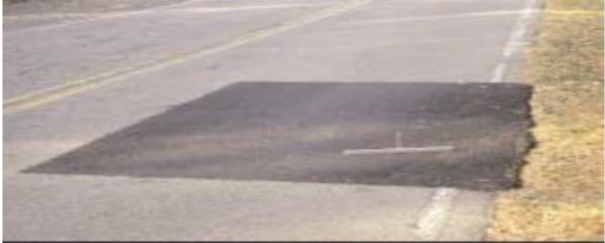
Figure 6: Patch on the road pavement surface.