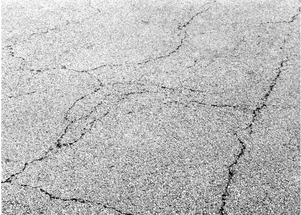
Figure 2: Block cracking of asphalt pavement ( www.roadscience.net/node?page=2 ).

Block cracking is similar to alligator cracking although these types of cracks are divided into rectangular pieces which are usually classified as longitudinal and transverse cracking. The reasons of block cracking are the age of asphalt binder the poor mixture of the binder.