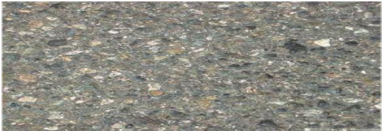
Figure 10: Polished aggregate on the asphalt pavement surface.

Polished aggregate is the worn away of the bitumen of the mixture to expose coarse aggregate (Miller and Bellinger 2003). The possible cause of polished aggregate is the use of soft aggregate that polish quickly under the traffic and the surface loss its macro texture as well as the surface sooth and rounded (Asphalt Institute 2016).