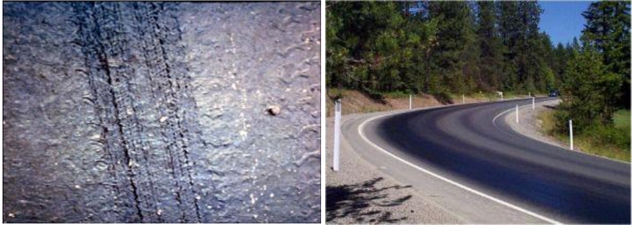
Figure 9: Bleeding and flushing on the asphalt pavement ( www.roadscience.net/node?page=2 ).

Polished aggregate is the worn away of the bitumen of the mixture to expose coarse aggregate (Miller and Bellinger 2003). The possible cause of polished aggregate is the use of soft aggregate that polish quickly under the traffic and the surface loss its macro texture as well as the surface sooth and rounded (Asphalt Institute 2016).