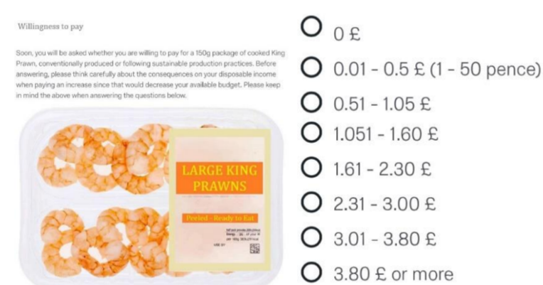
Fig 1. Survey's WTP questions (£5 baseline price for a 150g unit, 2024 prices)