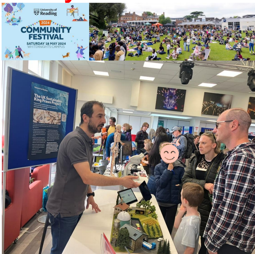
Fig 2 Community Festival Reading, May 2024