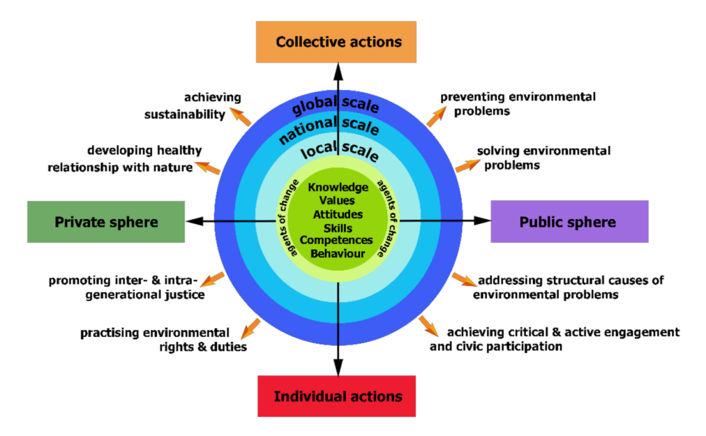
Figure 1. The Education for Environmental Citizenship (EEC) model (Source: Hadjichambis, A. Ch. & Paraskeva-Hadjichambi D. (2020). Education for Environmental Citizenship: the pedagogical approach. In: A. Ch. Hadjichambis, P. Reis, D. Paraskeva-Hadjichambi et al. (Eds.) Conceptualizing Environmental Citizenship for 21st Century Education (pp. 260–290). Cham, Switzerland: Springer.).