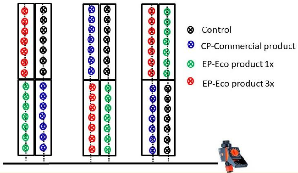
Figure 2. Experimental design for the tomato greenhouse study.