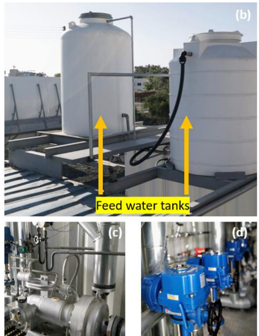
Fig. 5. (a) Steam generator (b) feed water tanks (c) variable speed pump (d) control valves. The authors would like to apologise for any inconvenience caused.