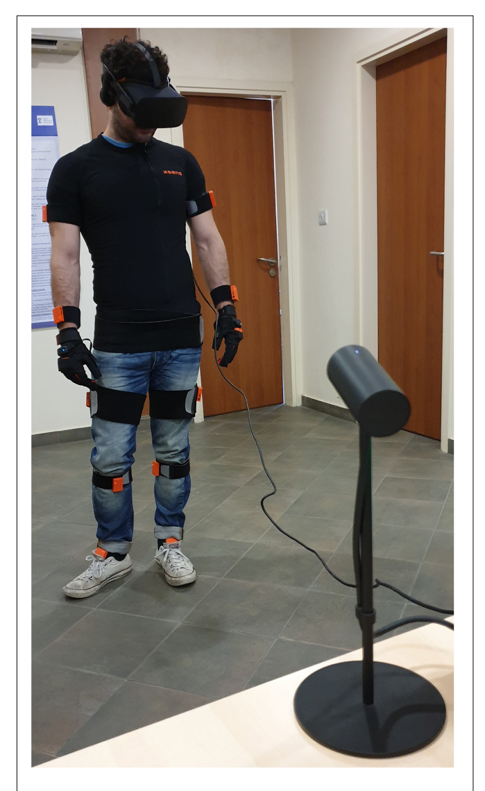
FIGURE 2 | One of the participants of the SC condition wearing the Oculus Rift, Xsens Awinda trackers, and Manus VR gloves.

It also included the following two measures: