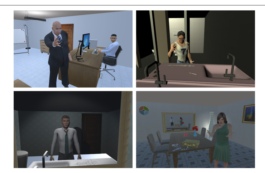
FIGURE 1 | Workplace scene (top-left), party scene (top-right), bathroom scene, illustrating the physical effects of cocaine use (bottom-left), consequences on the relationship (bottom right).

behavior (Myers, 2010). In this case and with our narrative, we wanted to show the participants, that in most cases situations drive people to drug use. According to the self-medication hypothesis (Khantzian, 1997, 2003), addictive drugs have appeal because during the short term they relieve painful feelings and psychological distress. There is a tendency in society to stigmatize drug users, as people think they use drugs for their enjoyment only. The character in the scenario is seen using drugs as a coping mechanism for the death of his mother and the stress from his work. Additionally, we followed the suggestion of Bertrand et al.'s (2018) for the embodiment of a digital avatar of an outgroup member that presents traits that contradict stereotypes, which we have done in our study. Additional screenshots from the scenes can be found in the Supplementary Table S1 .