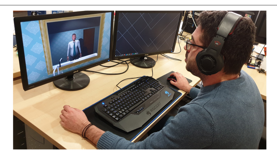
FIGURE 3 | One of the participants of the NSC group.

would experience through an application the life of the drug user, not imagine it.