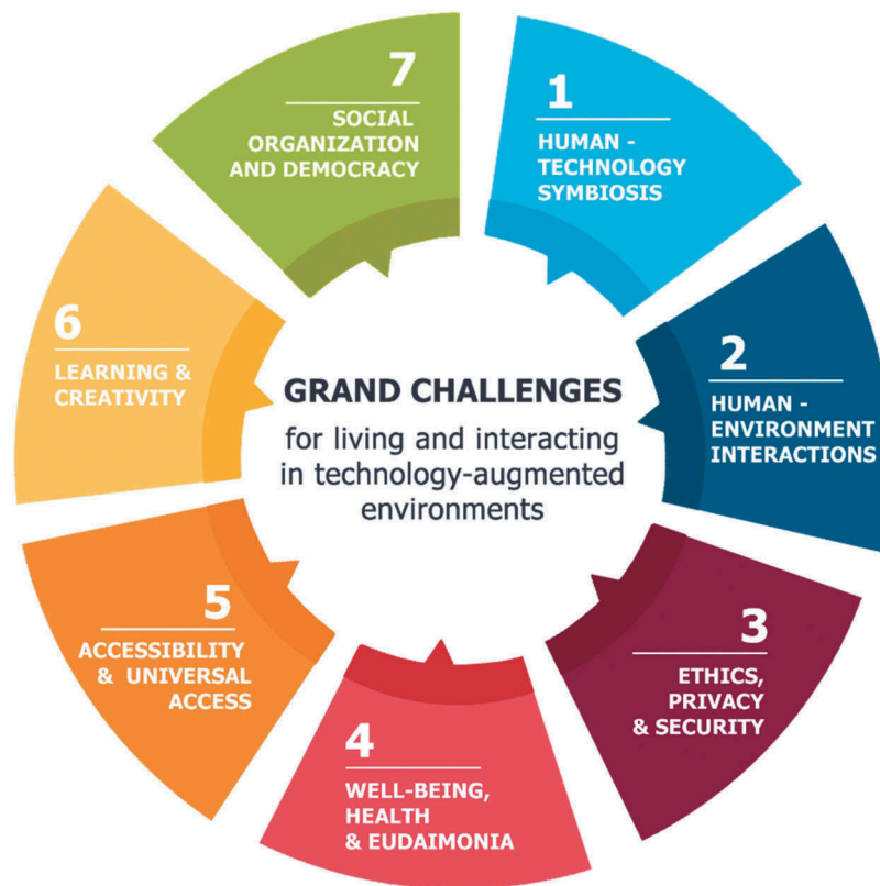
Figure 1. The Seven Grand Challenges.

The effort was motivated by the “intelligence” and the smart features that already exist in current technologies (e.g. smartphone applications monitoring activity and offering tips for a more active and healthy lifestyle, cookies recording web transactions in order to produce personalized experiences) and that can be embedded in future environments we will live in. Yet, the perspective adopted is profoundly human-centered, bringing to the foreground issues that should be further elaborated to achieve a human-centered approach – catering for meaningful human control, human safety and ethics – in support of humans’ health and well-being, learning and creativity, as well as social organization and democracy.