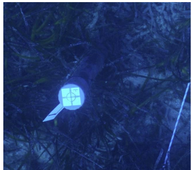
Figure 2. Control point fixation and marking.

At the same study it is estimated that up to depths of 10m, the standard deviation of tape measurements of up to 20m distances, is 25mm, after outlier removal. Atkinson et al. (1988), studied a 14x3m wide area at 30m depth, using 15 control points and report that a realistic expectation of tape measurement precision is 0.05m. They also reported of high