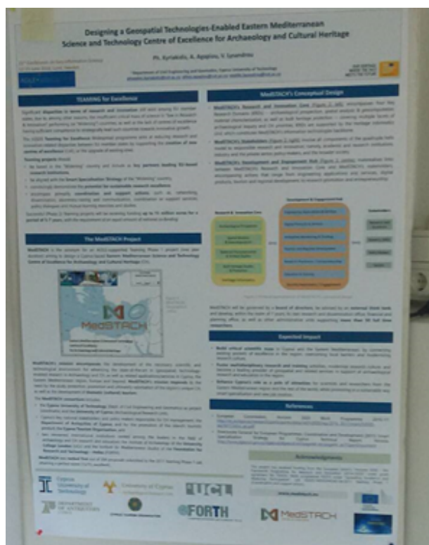
The MedSTACH poster on display during the AGILE conference, in Lund, June 2018.