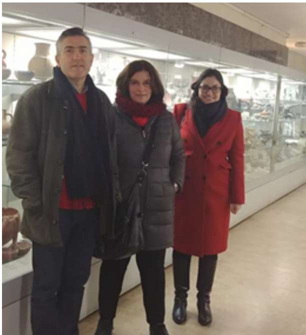
The UCY delegation in front of the Cypriot Antiquities collection of UCL Institute of Archaeology.