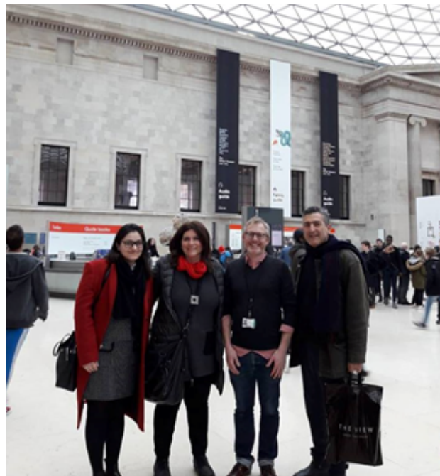
The UCY delegation with the Curator of the Cypriot Collection at the British Museum.