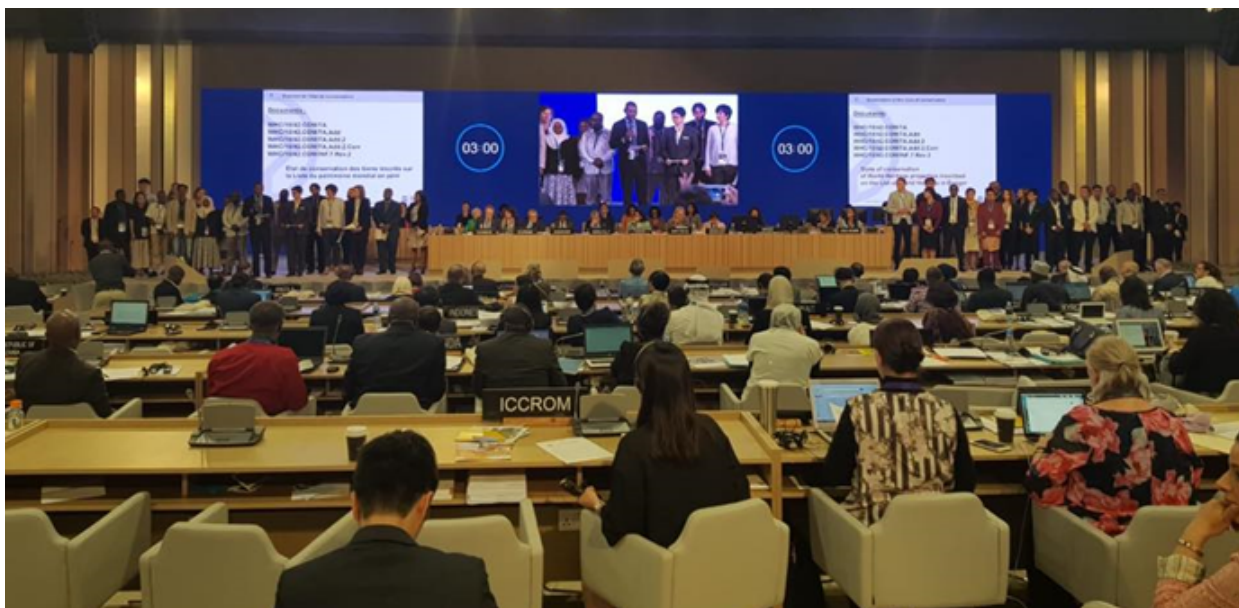
The venue of the 42nd World Heritage Session