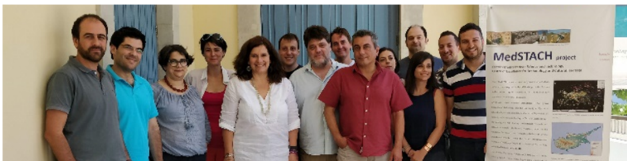
Group photo of the MedSTACH team at CUT, Limassol, June 2018.

tion of related Work Packages and tasks. During the second day of the meeting, Deloitte was invited to present the financial aspects of the business plan of the project, highlighting the strengths along the targeted areas for improvement of the proposed Centre of Excellence (CoE), and then partners discussed with Deloitte possible actions that should be taken to ensure the sustainability of the CoE for the years to come. Consortium partners also discussed the organisation for the upcoming MedSTACH symposium that will be held at the end of August 2018, aiming to showcase the prospects, opportunities and challenges associated with the proposed CoE.