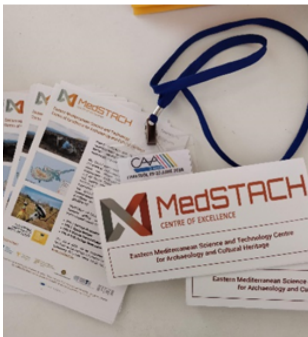
Promotion material distributed to the participants of the CAA-GR Conference, Limassol 2018.