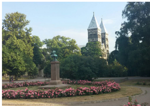
The venue of the AGILE 2018 conference at Lund University, Sweden.

on how geospatial technologies could be used and enhanced in a way that would be beneficial for the understanding and the valorisation of Cultural Heritage within an eastern Mediterranean context.