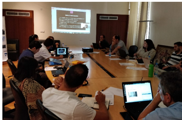
The MedSTACH consortium during its final meeting at CUT, June 2018.

The final Consortium meeting of MedSTACH Phase I project took place on the 21st and 22nd of June at the premises of the Cyprus University of Technology in Limassol. Consortium members held roundtable discussions regarding the planning of forthcoming activities for the remaining time period of Phase I. Participants discussed the deliverables that need to be submitted before the end of August 2018 showcasing the work conducted so far alongside the various meetings that took place throughout Phase I, with several public and private bodies from the eastern Mediterranean region. In addition, partners expressed their commitment in gathering relevant letters of support from those organisations that will add important value to the proposal towards its submission for Phase II, in November. Before concluding the first day of roundtable discussions, partners assigned to individual MedSTACH members all remaining pending activities towards the November submission, including proposal structure and writing, as well as the comple-