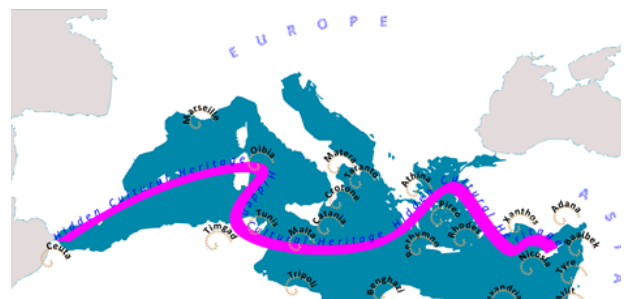
The poster of the 4th Biennial of Urban and Architectural Heritage (BRAU4)