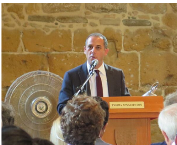
The Minister of Transport, Communications and Works, Mr. Marios Demetriades