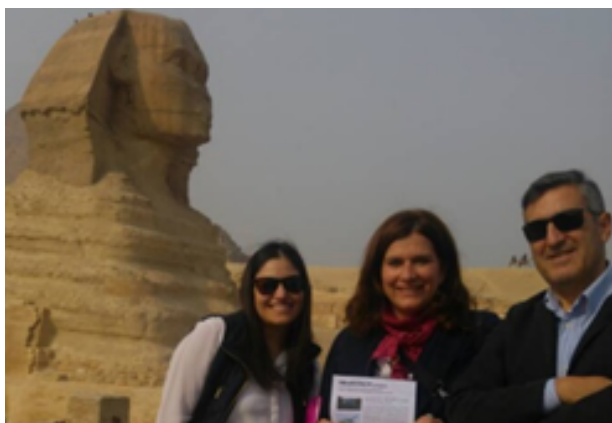
MedSTACH at the Sphinx!

The visit to Cairo came soon after the 5th Cyprus-Egypt-Greece summit held in Nicosia on the 21st of November, where the three countries expressed their joint interest in preserving and protecting the cultural heritage of the eastern Mediterranean and Middle East, as stated in the joint declaration of the summit. The University of Cyprus was also received by HE the Minister of Antiquities of the Arab Republic of Egypt, Dr Khaled El-Enany. The University of Cyprus extends its gratitude to the Embassy of the Republic of Cyprus in Cairo, for the support offered to the delegation prior and during this significant trip.