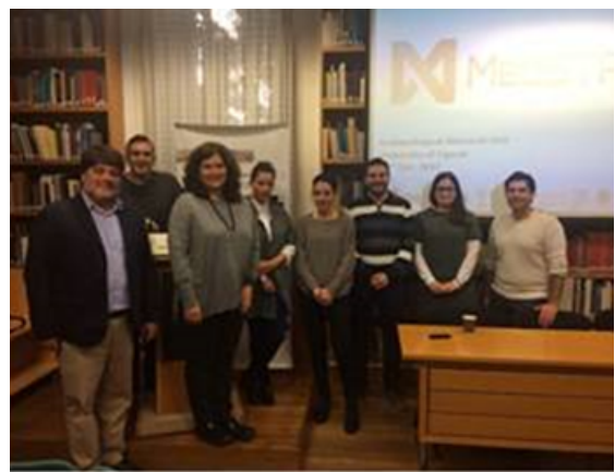
MedSTACH Info Day at the Archaeological Research Unit of the University of Cyprus