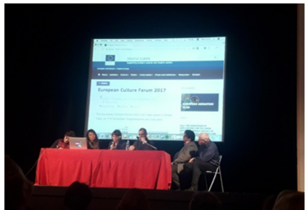
The launching of the European Year of Cultural Heritage 2018

As MedSTACH's key objective is the conduct of archaeological research so as to provide for the sustainability of culture, it is the National Coordinator's belief that this project should form part of the activities put forward by the Republic of Cyprus, celebrating the common culture of Europe.