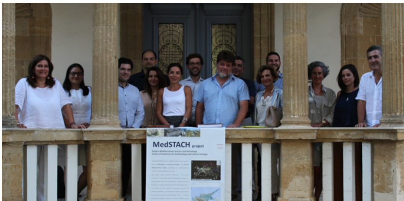
The MedSTACH consortium

The MedSTACH consortium is coordinated by the Department of Civil Engineering and Geomatics of the Cyprus University of Technology (lead partner), and includes as partners the Archaeological Research Unit of the University of Cyprus, the Department of Antiquities of Cyprus – the national stakeholder and policy maker responsible for cultural heritage management on the island, and the Cyprus Tourism Organisation – the national stakeholder a policy maker responsible for the promotion of Cyprus’s touristic product. The consortium also includes the Laboratory of Geophysical-Satellite Remote Sensing and Archaeo-environment of the Institute for Mediterranean Studies of the Foundation for Research and Technology – Hellas (FORTH), and the Institute of Archaeology of the University College London (UCL), both of which convey the experience and expertise of leading international research and academic institutions.