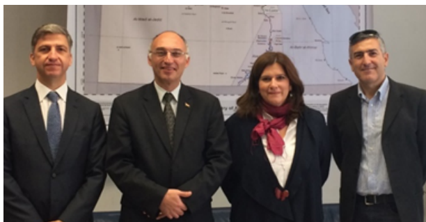
From the courtesy meeting with HE the Minister and Deputy Minister of Antiquities of the Arab Republic of Egypt.