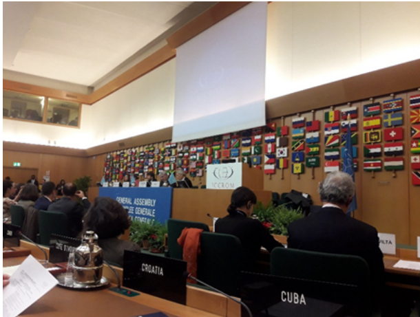
The 30th General Assembly of ICCROM