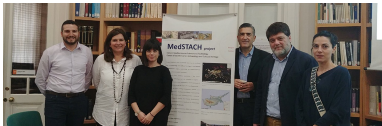
MedSTACH at the “Archaeological Research of the University of Cyprus for 2017” Conference