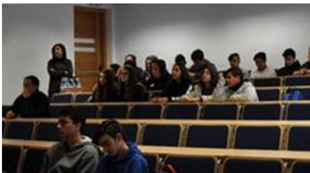
MedSTACH at the Gymnasium of Agios Neophytos, Limassol