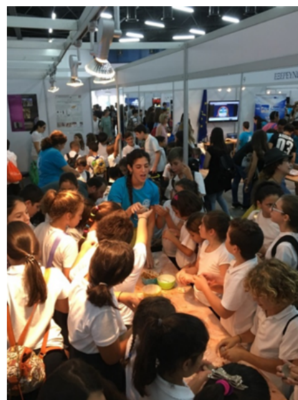
MedSTACH and Archaeology at Researcher's Night 2017 in Nicosia!