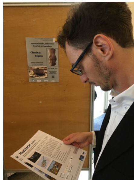
MedSTACH at Graz