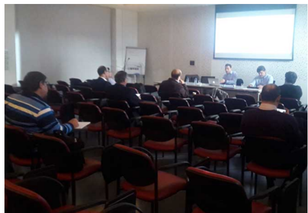
MedSTACH Info Day at the Technical Chamber of Cyprus

An Info Day on the MedSTACH Project was organized on the 20 th of December 2017 by the Department of Civil Engineering and Geomatics of the Cyprus University of Technology, Coordinator of the Project. The Info Day was hosted by the Technical Chamber of Cyprus in Nicosia. Representatives of all Cypriot engineering and technical associations operating in the fields of heritage study, protection, restoration and promotion had the opportunity to get information about the project and exchange opinions. A fruitful discussion paved the way for future collaboration between local stakeholders and the MedSTACH Centre of Excellence.