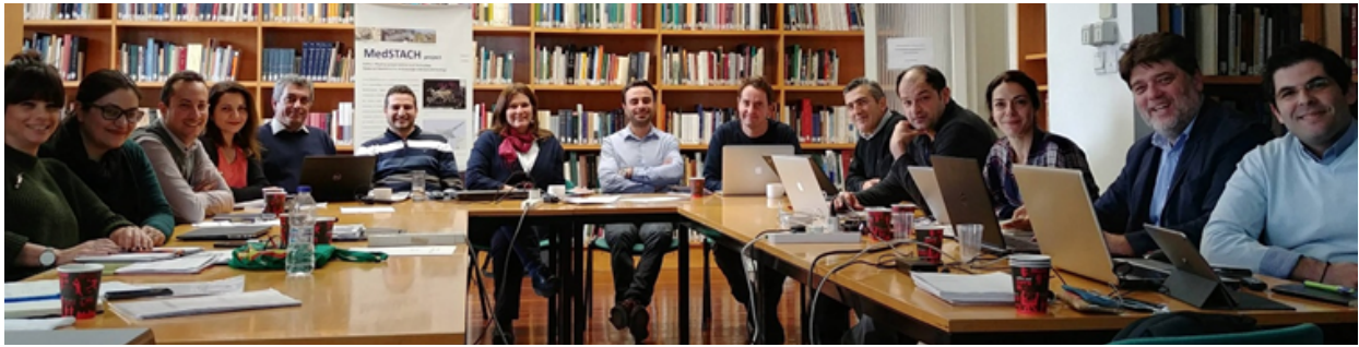
The MedSTACH consortium at the Interim Meeting held at the Archaeological Research Unit of the University of Cyprus 10 th -11 th of January 2018.