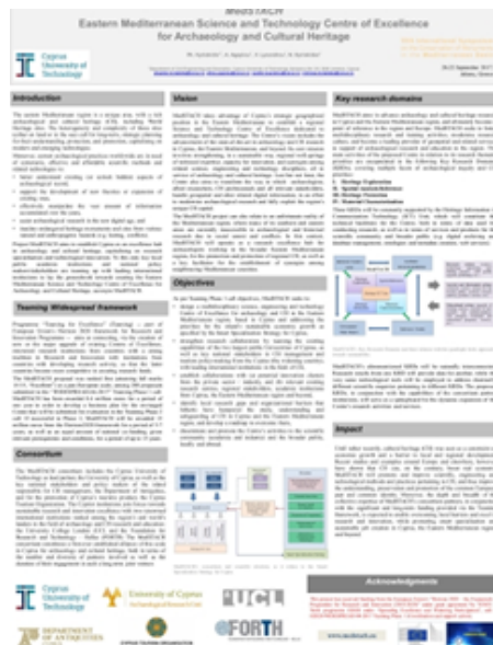
MedSTACH at the 10th International Symposium on the Conservation of Monuments in the Mediterranean Basin