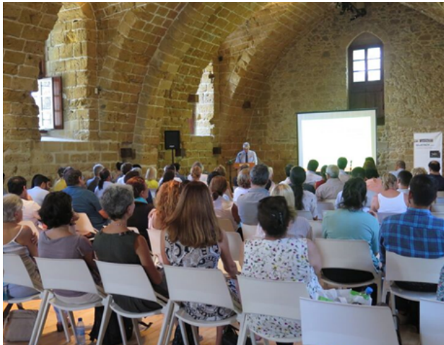
"Kastelliotissa" Medieval Hall, in Nicosia, Cyprus