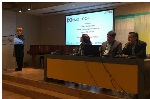
MedSTACH Info Day at the “House of Cyprus” in Athens

An Info Day was organized in Athens by the Archaeological Research Unit of the University of Cyprus in the beginning of 2018 and hosted at the “House of Cyprus”. The Info Day was aimed at colleagues who are involved in the study, protection or display of cultural heritage and offered a platform for the development of an effective dialogue between them and the MedSTACH partnership. Numerous representatives of public and private organisations and companies attended the Info Day, including individuals from the Ministry of Culture and Sports, National Technical University of Athens, University of the Aegean, National Centre for Scientific Research ‘Demokritos’, Fitch Laboratory / British School at Athens, American School of Classical Studies at Athens, Australian Archaeological Institute at Athens, Time Heritage, Museum of Cycladic Art, Tinos Virtual Museum, AE-THERIA LTD, THETIS Authentics Ltd, Post Scriptum Ltd. The event set the foundations for a productive dialogue and opened up the possibilities for future collaborations.