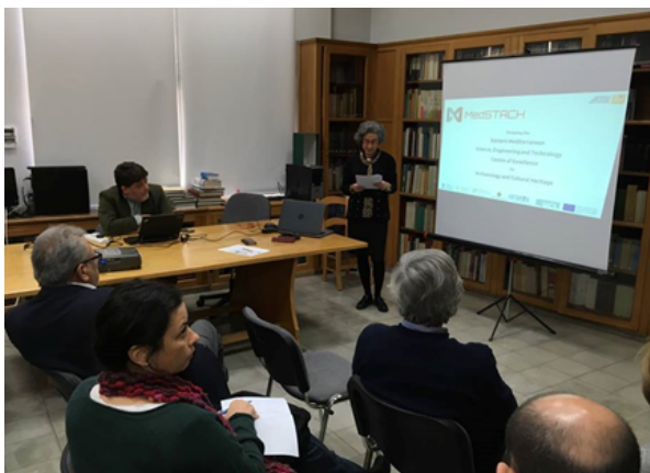
MedSTACH Info Day at the Cyprus Museum

An Info Day for the promotion of MedSTACH was organized by the Department of Antiquities in the library of the Cyprus Museum in Nicosia. The aim of this event was to inform important stakeholders from the public sector, which are also among the close collaborators of the Department of Antiquities, about the scope of MedSTACH , and the ways in which the activities that will be put forward within this Centre of Excellence, will provide support and facilitate the work currently undertaken by these authorities and agencies. Another aim was to list ideas from these stakeholders, as to the scientific fields that need to be developed, based on current needs. Future synergies between MedSTACH and the public sector were therefore promoted as part of the event, for the protection and promotion of cultural heritage in Cyprus and the Eastern Mediterranean, based on high-end scientific research.