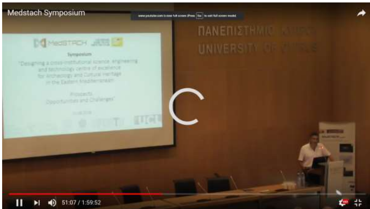
Screenshot from the live streaming of the symposium (Mr. Stavros Benos*,Diazoma Association, former Greek Minister of Culture, * greeting in absentia)