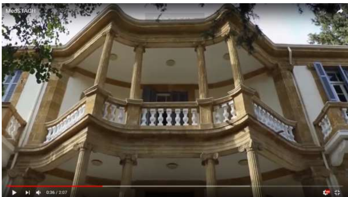
The building of the Archaeological Research Unit of the University of Cyprus