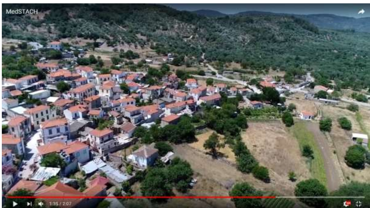
Survey drone image of a village in Cyprus