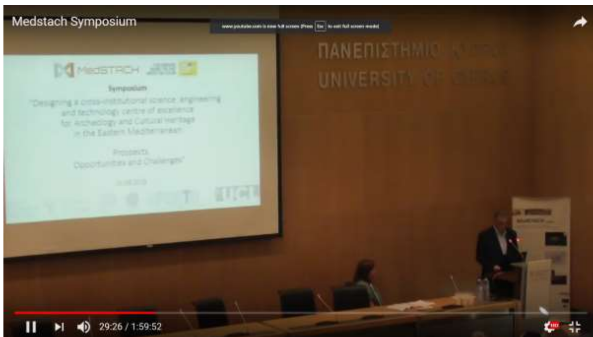
Screenshot from the live streaming of the symposium (Representative on behalf of Dr. Kostas Champiaouris, Minister of Education and Culture)