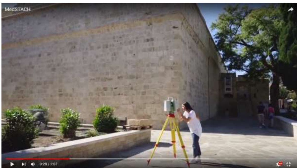
The Limassol Castle (Medieval Museum)