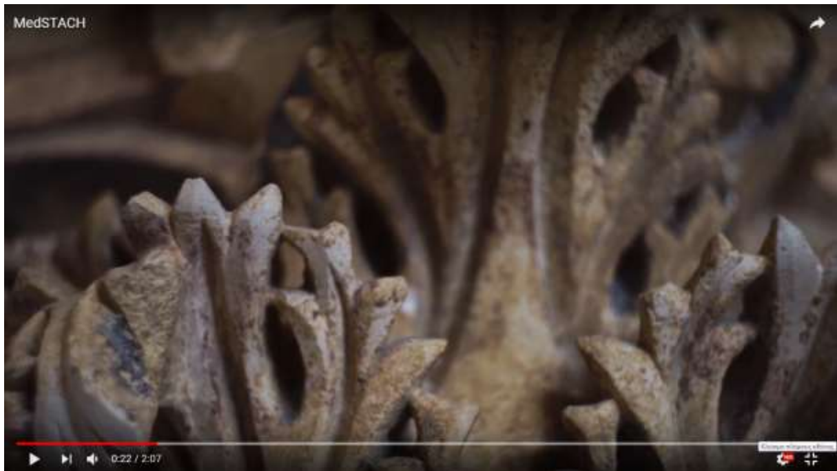
Decoration at the Limassol Castle