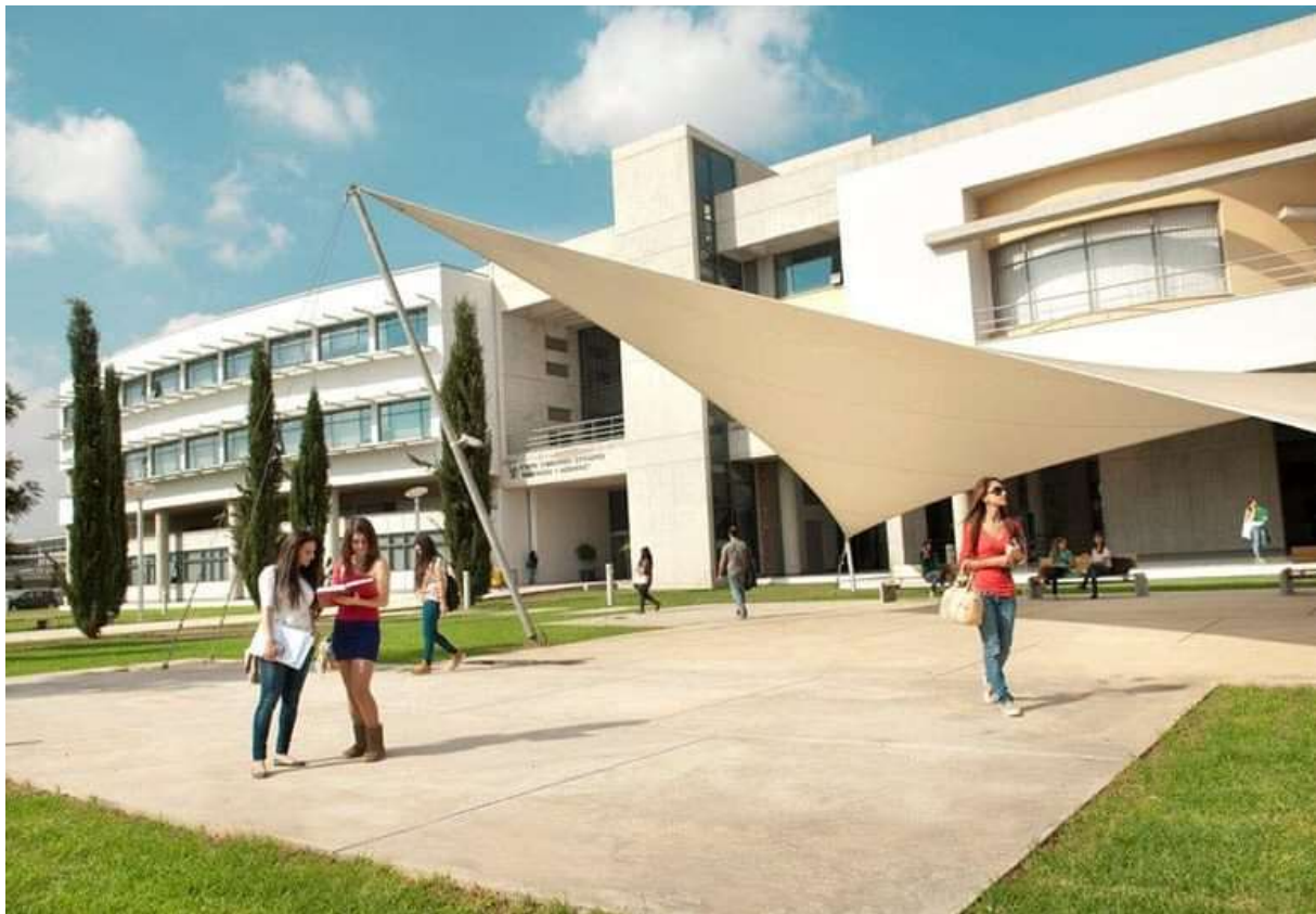
University of Cyprus, venue of MedSTACH's Final Conference held on 31 st August 2018.

The presentation of MedSTACH can be found on the YouTube channel of the Archaeological Research Unit (Member of MedSTACH's consortium) in the following link: https://www.youtube.com/results?search_query=archaeological+research+unit+university+of+cyprus