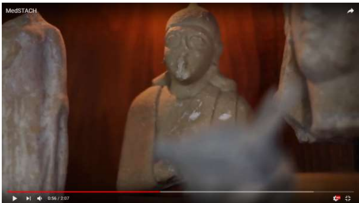
Ancient limestone figurines from the Glafkos Clerides private collection, exhibited at the Archaeological Research Unit of the University of Cyprus