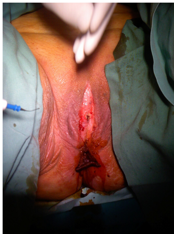
Figure 2 Dissected labia majora. Post-operative appearance of the labia after the blunt dissection and separation.

On day two of admission our patient underwent laparoscopic surgery during which the right pyosalpinx was identified and subsequently resected (Figure 2), and in the end the labia majora were reconstructed via blunt labial dissection and separation (Figure 3). During the operation, we also identified accumulation of a large amount of urine in the vagina, suggestive of urocolpos,