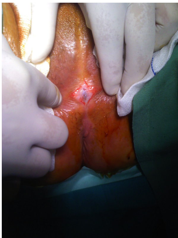
Figure 1 Labial fusion: pre-operational image of labial fusion. The labia majora are completely fused, leaving a very small opening to allow urination.

followed by a drop on day two (142 mg/L) and then the level remained within normal limits throughout the rest of her hospital stay and finally an elevated lactate dehydrogenase level (286 U/L). Carcinoembryonic antigen (CEA), \alpha -fetoprotein (AFP), \beta -human chorionic gonadotropin ( \beta -HCG), cancer antigen 125 (CA 125), cancer antigen 19.9 (CA 19.9) and cancer antigen 15.3 (CA 15.3) levels were all normal. Serum urea, creatinine, sodium and potassium levels were within normal limits. A computed tomography (CT) scan of her abdomen on admission showed a cystic (7 \times 4.5 cm) formation within the pelvis minor in the anatomical position of the right adnexa; the formation appeared to be tubular in shape most likely suggesting a hydrosalpinx or pyosalpinx.