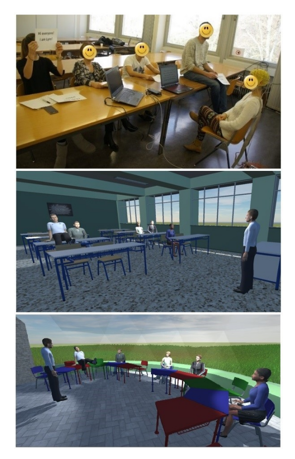
Fig. 1. Physical (Real) Classroom space (top), Virtual Environment with Realistic Appearance (middle) and Virtual Environment with Imaginary Appearance (bottom)

The imaginary environment was designed based on suggestions by active and experienced teachers who would prefer to be trained within a virtual world that does not simulate the real classroom that is part of their daily routine.