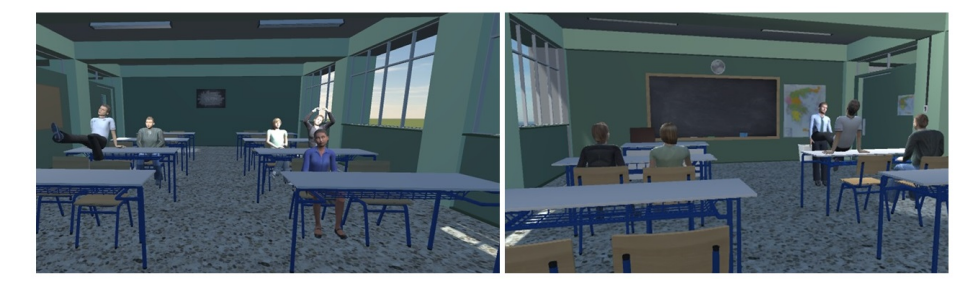
Fig. 2. Experiencing the virtual worlds through the eyes of the student Lynn (right) and through the eyes of the teacher (left)

The scenario and the dialogues were the same at both perspectives, changing only the camera position allowing the user to experience the two different viewpoints.