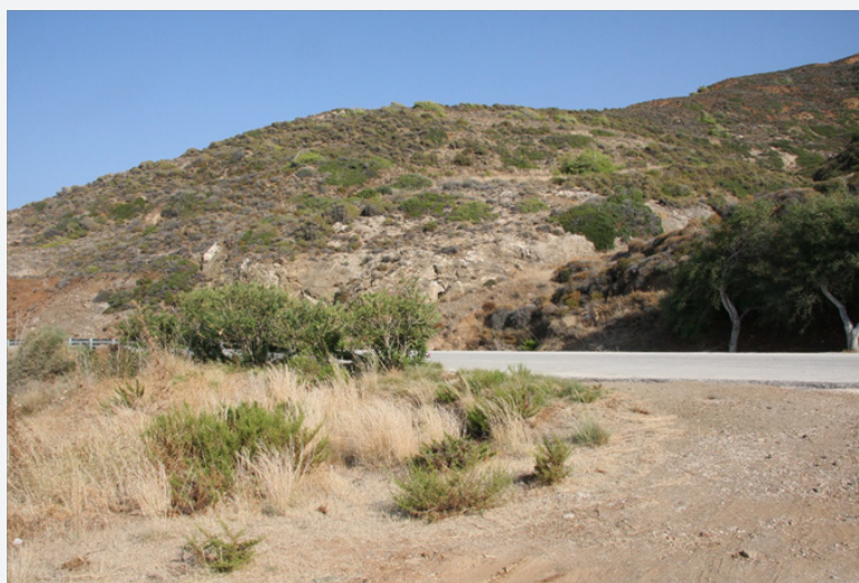
Figure 2: One of the rocky cliffs honeycombed by rock-cut tombs.

different chronological periods of the history of Cyprus. The identified tombs were all hewn out of the natural rock, mainly cut into the steep and rough rock face (Figure 2). The in situ observations and documentation have been completed with the topographical mapping of the tombs. The study area was firstly observed mainly through cadastral maps. All data collected were elaborated for digitization and mapping and introduced into a Geographical Information Systems (hereafter GIS) environment. In total five main areas have been identified with rock-cut ancient tombs, all of them looted. In the first two areas more than 70 individual tombs have been accurately recorded.